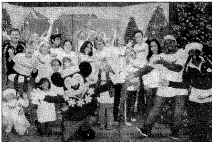
Disney VoluntEARS gather at the Foothill Family Service Adopt-A-Family event