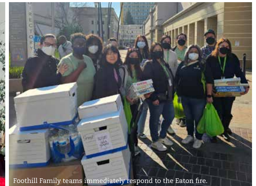
Foothill Family teams immediately respond to the Eaton fire.