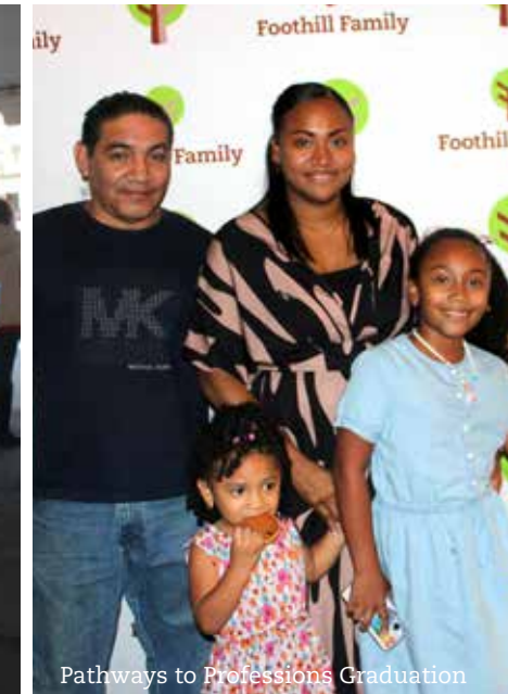
Pathways to Professions Graduation