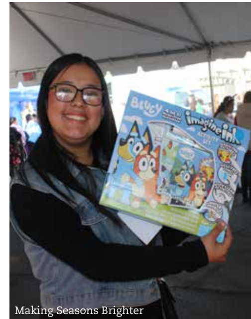
Making Seasons Brighter

$20,000 raised to spread Kindness to school-based therapists