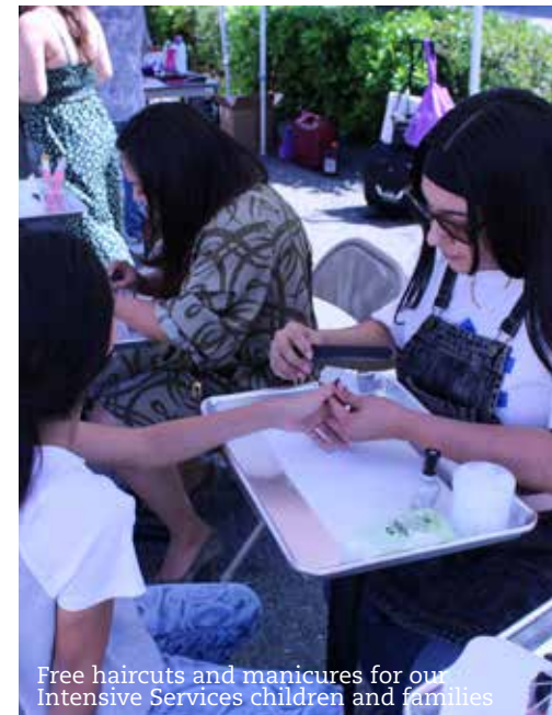
Free haircuts and manicures for our Intensive Services children and families