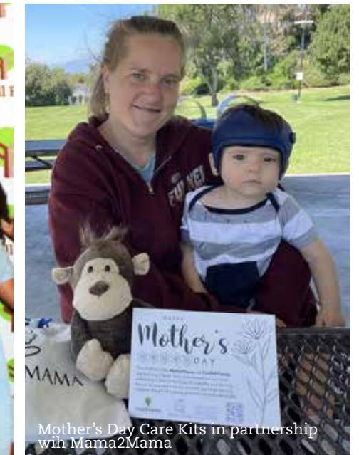
Mother's Day Care Kits in partnership with Mama2Mama