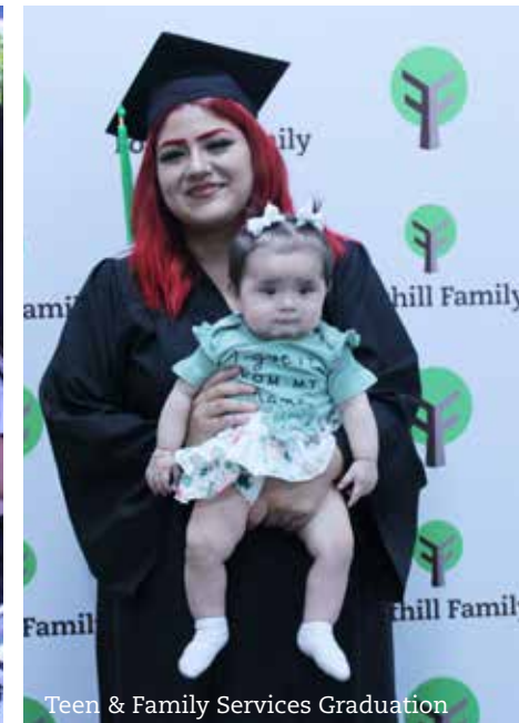
Teen & Family Services Graduation