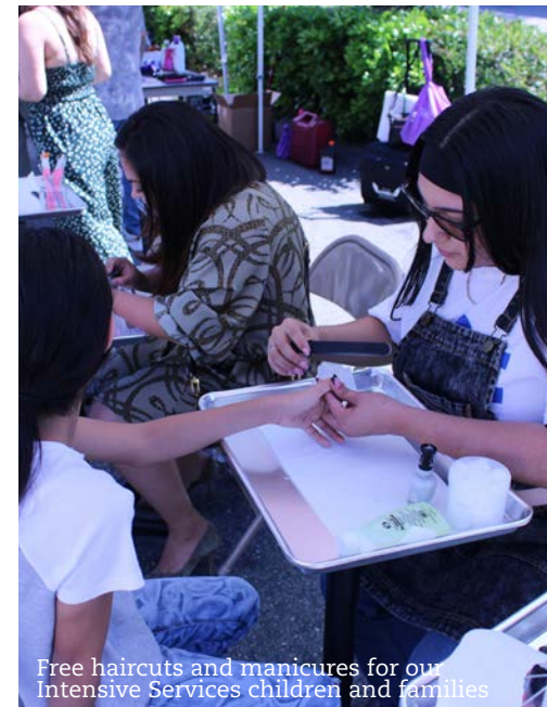
Free haircuts and manicures for our Intensive Services children and families