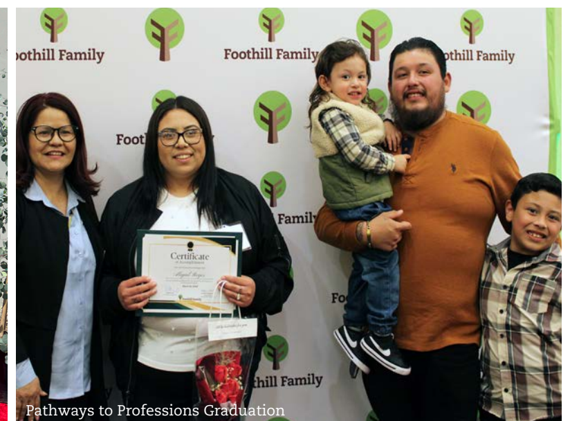
Pathways to Professions Graduation