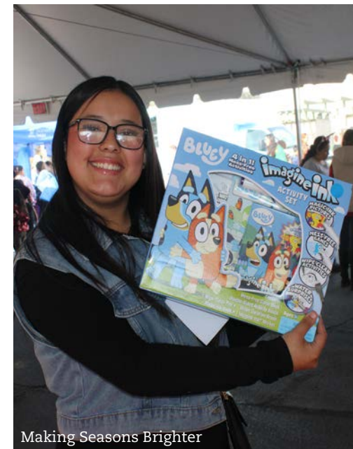
Making Seasons Brighter

More than $420K raised at annual Gala & Auction in support of Foothill Family's life-changing programs — an all time record.