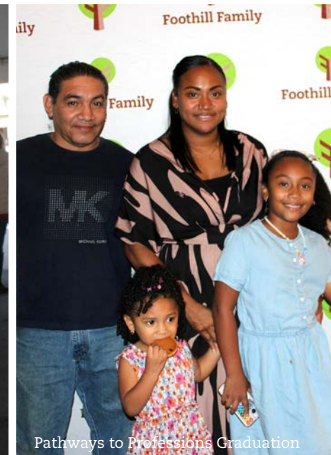
Pathways to Professions Graduation