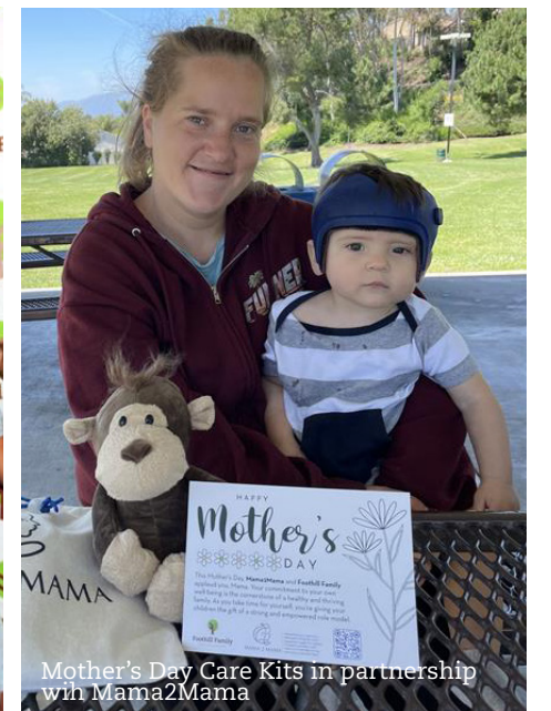
Mother's Day Care Kits in partnership with Mama2Mama