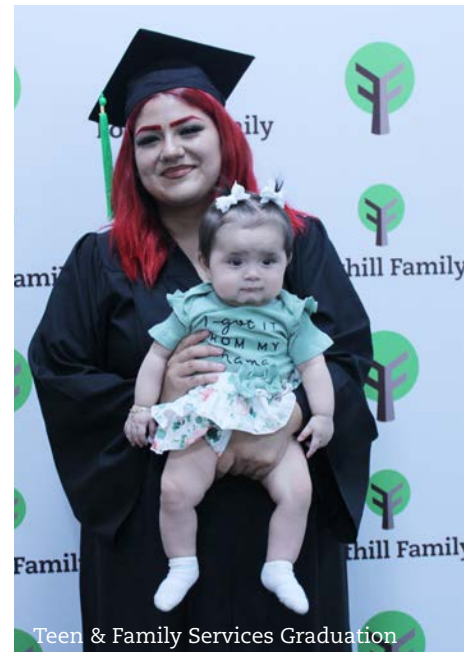
Teen & Family Services Graduation