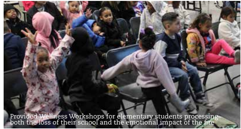
Provided Wellness Workshops for elementary students processing both the loss of their school and the emotional impact of the fire