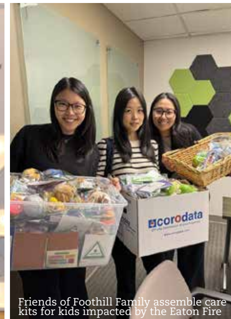
Friends of Foothill Family assemble care kits for kids impacted by the Eaton Fire