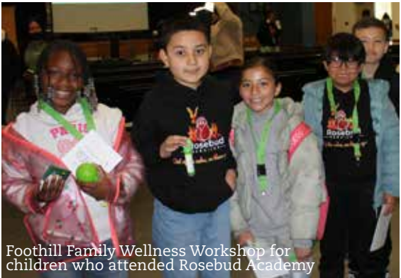
Foothill Family Wellness Workshop for children who attended Rosebud Academy

Building on that foundation, we launched Eaton Bloom , a long-term recovery initiative that expands trauma-informed care, strengthens school partnerships, and ensures ongoing therapy access for uninsured and high-need families. Together, these efforts have created a continuum of care that supports both immediate recovery and lasting resilience.