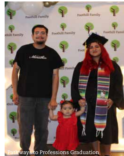
Pathways to Professions Graduation

40 community toy drives 250 kids received gifts 1600 toys + gifts donated 500 books donated 1300 pounds farm fresh produce donated