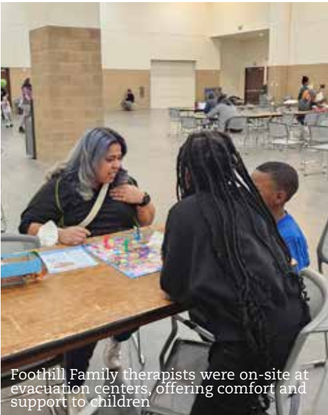
Foothill Family therapists were on-site at evacuation centers, offering comfort and support to children