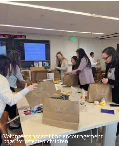
Volunteers assembling encouragement bags for affected children