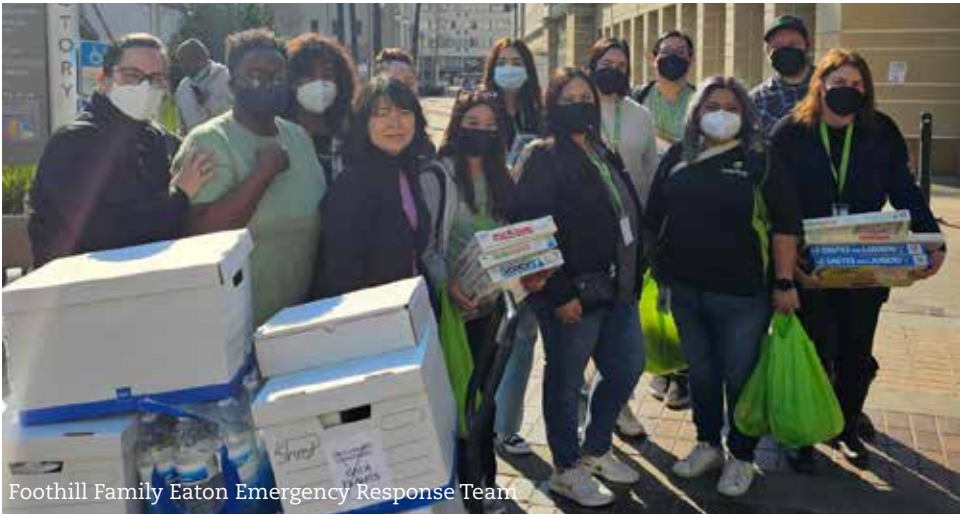
Foothill Family Eaton Emergency Response Team