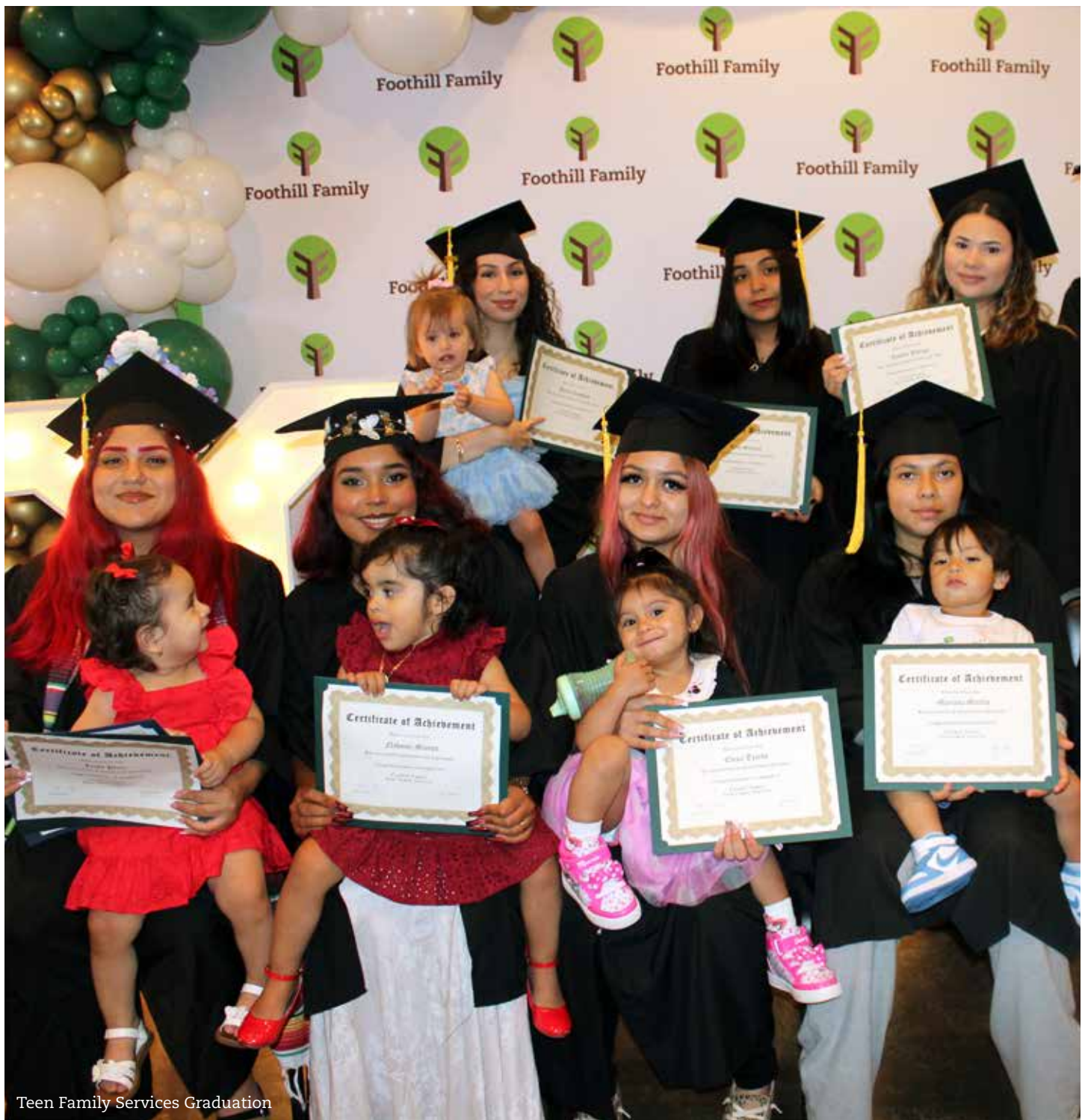
Teen Family Services Graduation