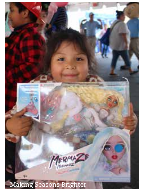
Making Seasons Brighter