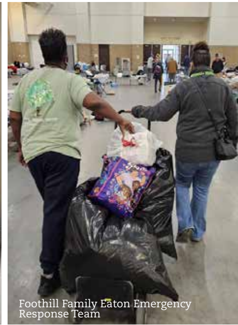
Foothill Family Eaton Emergency Response Team