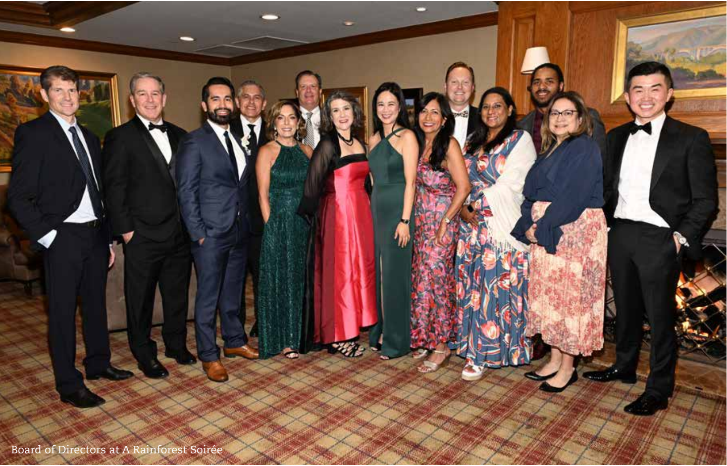
Board of Directors at A Rainforest Soirée