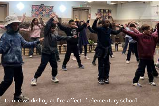
Dance Workshop at fire-affected elementary school