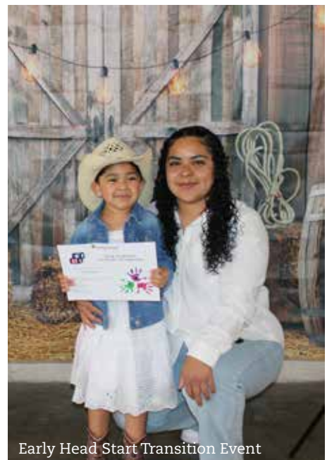
Early Head Start Transition Event