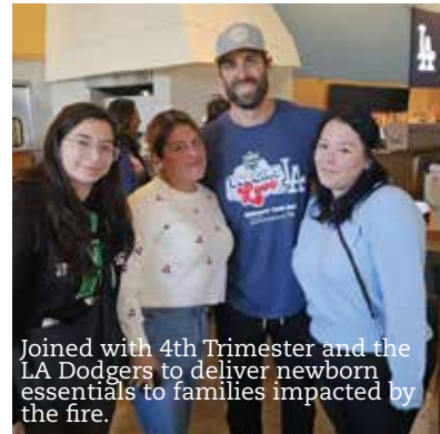
Joined with 4th Trimester and the LA Dodgers to deliver newborn essentials to families impacted by the fire.