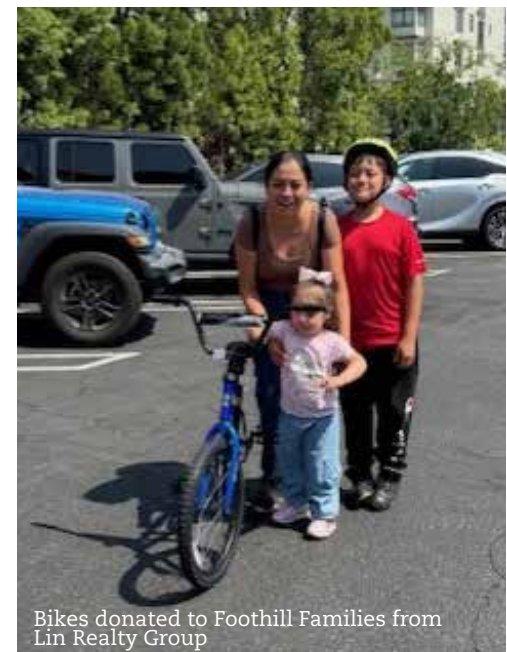
Bikes donated to Foothill Families from Lin Realty Group