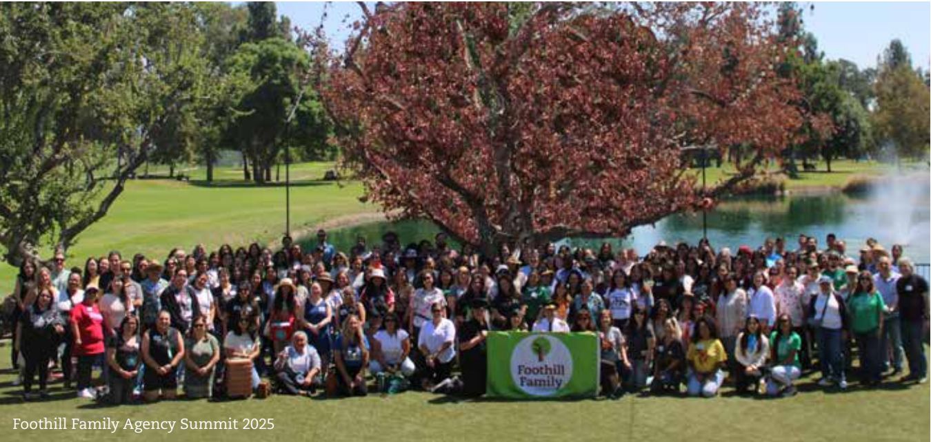
Foothill Family Agency Summit 2025

Foothill Family is indebted to our dedicated employees who sustain and elevate the agency with their passion, talent, and expertise, many of whom simultaneously support Foothill Family philanthropically. Our team demonstrated remarkable unity this year, giving to families in the community and rallying around staff members who faced their own devastating losses in the fire. The Foothill Family team contributed over $58,000, with 40% of the staff participating. The following recognition includes employee giving from July 1, 2024 to June 30, 2025.