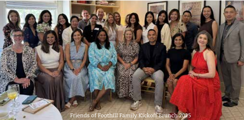
Friends of Foothill Family Kickoff Brunch 2025