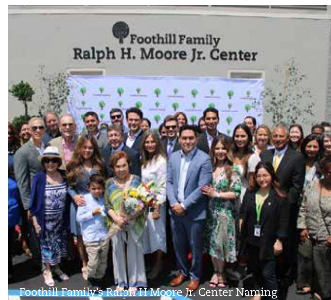
Foothill Family's Ralph H Moore Jr. Center Naming