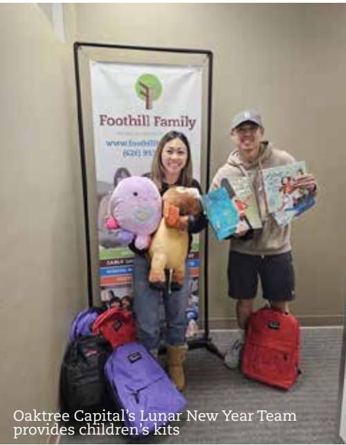
Oaktree Capital's Lunar New Year Team provides children's kits

postpartum families reached through trauma-informed joint 4th Trimester workshops