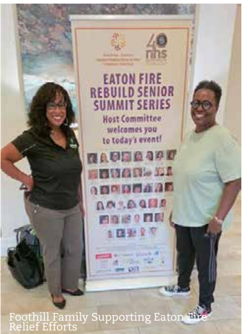
Foothill Family Supporting Eaton Fire Relief Efforts